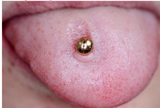
Figure 1. A traumatic fibroma located on the dorsal surface of the tongue at the site of insertion of a tongue piercing in a 22-year-old patient who has worn the piercing for six years, accompanied by localized atrophic changes of the surrounding mucous membrane, highlighting the mucosal response to prolonged mechanical contact. [7]

complete excision of the lesion, including its implantation base, with the excision performed 2 mm beyond its clinical margins into healthy tissue [27]. The prognosis for irritation fibroma is excellent; the recurrence rate is very low if the excision was complete, and the mucosa is no longer subjected to trauma [29].