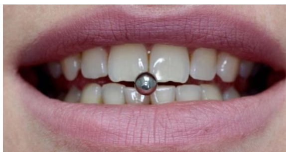
Figure 4. Traumatic changes of the upper central and lateral incisors (teeth 1.1, 1.2, and 2.1) resulting from repeated manipulation of a tongue piercing, emphasizing the mechanical impact of prolonged contact between the jewelry and the teeth.

from Samoilenko AV, et al. illustrates traumatic changes on the upper central and lateral incisor caused by manipulation of a tongue piercing. These changes are consistent with previous reports indicating that repetitive trauma can lead to enamel wear [7].