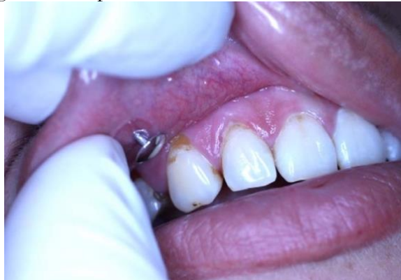
Figure 3. Localized gingival changes, including recession, in a 27-year-old patient who has worn a labret piercing for three years, with gingival recession at the upper right canine (tooth 1.3) and other affected teeth adjacent to the piercing site, emphasizing the effect of prolonged mechanical trauma on gingival integrity [7]

prolonged mechanical trauma on gingival integrity.[47]. The progression of this process can be halted by removing the piercing and reducing inflammation, but the gingival defect may, unfortunately, remain [46]. Consequently, gingival recession is most often classified as an irreversible lesion, and reattachment of the gingiva to its initial level can be achieved through surgical methods.